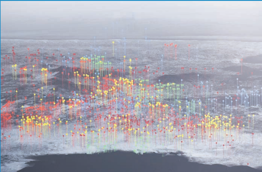
Student Work for Jakarta: Models of Collective Space for the Extended Metropolis