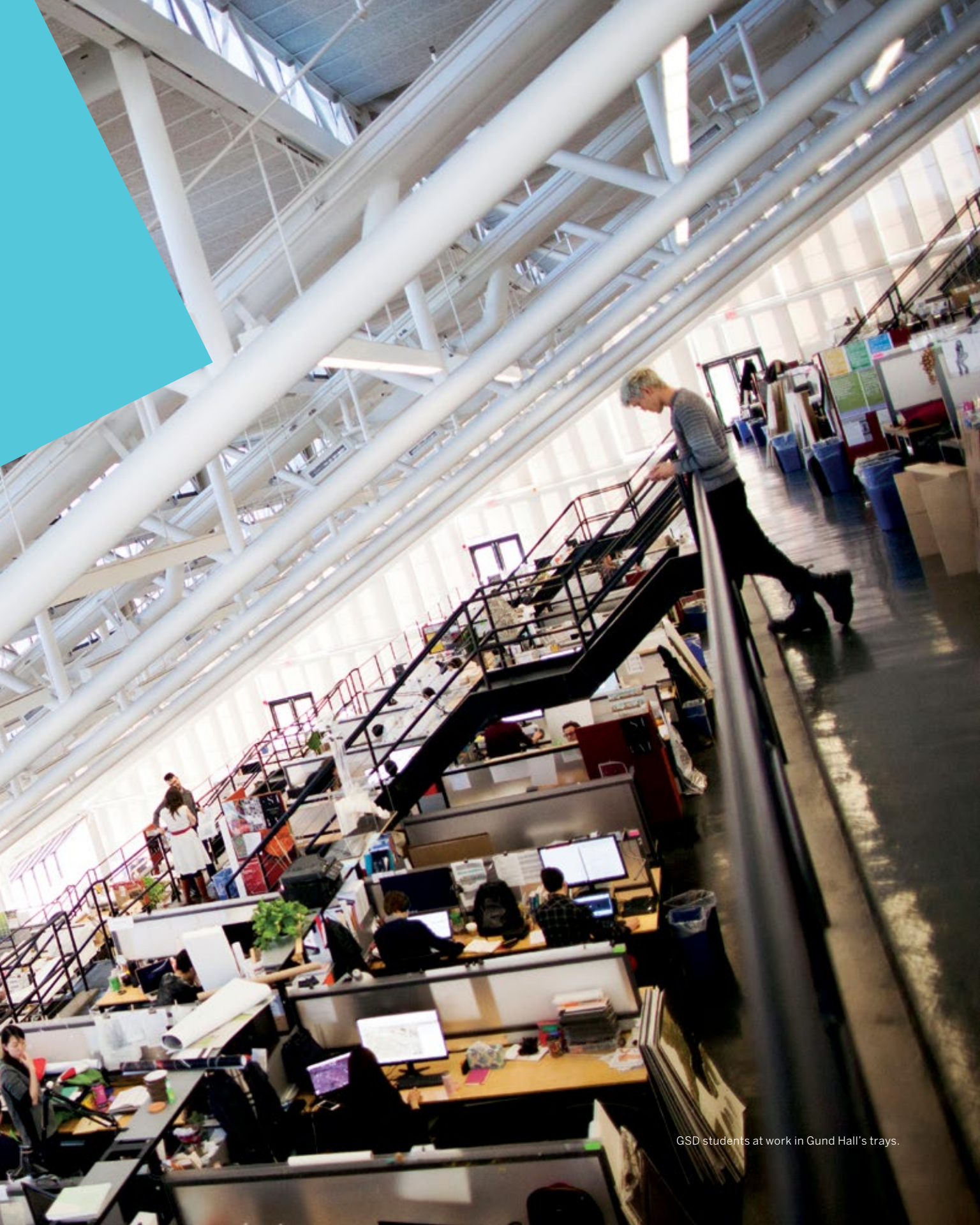
GSD students at work in Gund Hall's trays.