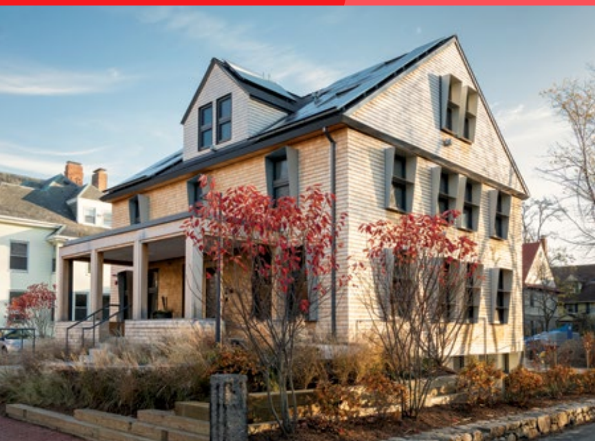
HouseZero, the office of the GSD's Harvard Center for Green Buildings and Cities in Cambridge, MA.

From the flow of air through a house to the violent transformation of shorelines as a result of wave action, movement is a key factor in the design of buildings, cities, and landscapes. Even as designers dedicate their energy to the solidity and permanence of their work, they must also consider how people move through and toward the spaces that define their living environment.