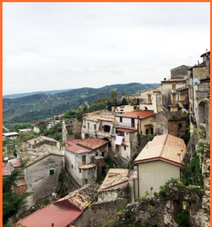
Students who participated in the spring 2017 studio abroad program in Rotterdam visited the European countryside to learn under architect and Professor Rem Koolhaas, founding partner of OMA and its research-oriented counterpart AMO.

GSD students participating in these semester-long studios have investigated topics that include animal-human interaction, post-human architecture and landscapes, counterculture communes as models of utopian cohabitation, and the semiotics of rural life as represented in mass media. In February 2020, the Solomon R. Guggenheim Museum in New York City will present Countryside: Future of the World , an exhibition highlighting the work of GSD students around the transformation of non-urban landscapes.