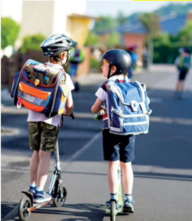
Cities present numerous safety challenges for children.