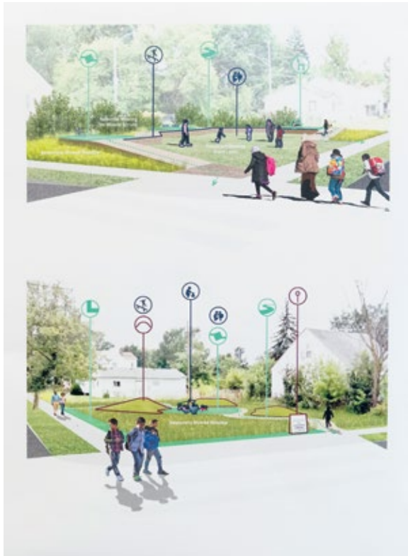
Image from the final studio review for "Refugees in the Rust Belt."