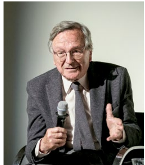
Rafael Moneo, Josep Lluís Sert Professor in Architecture, speaks during the public program "How Will Architecture Be Conceived?"