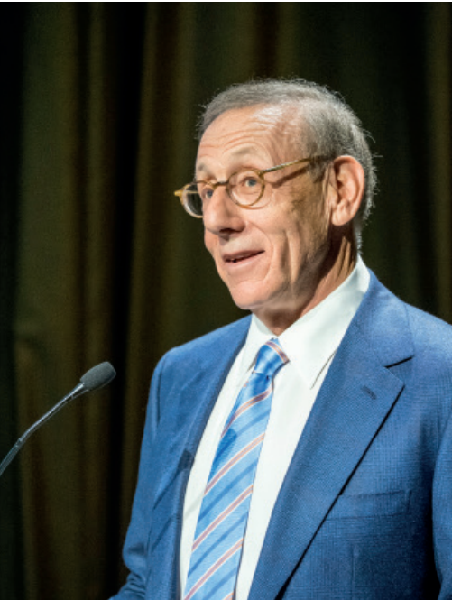
Left: Stephen Ross, chairman of Related Companies, speaks about the Hudson Yards development project.