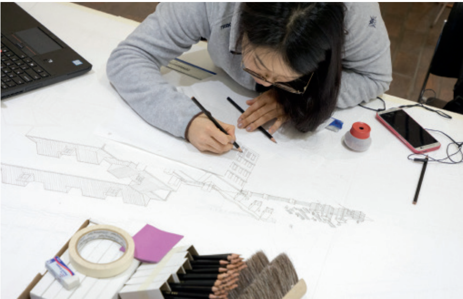
Bottom: A student drawing as part of the J-term class "Public Drawing Workshop" with Atelier Bow-Wow, the 2016 Dunlop Visiting Professors; and the Harvard University Graduate School of Design Exhibitions Department.