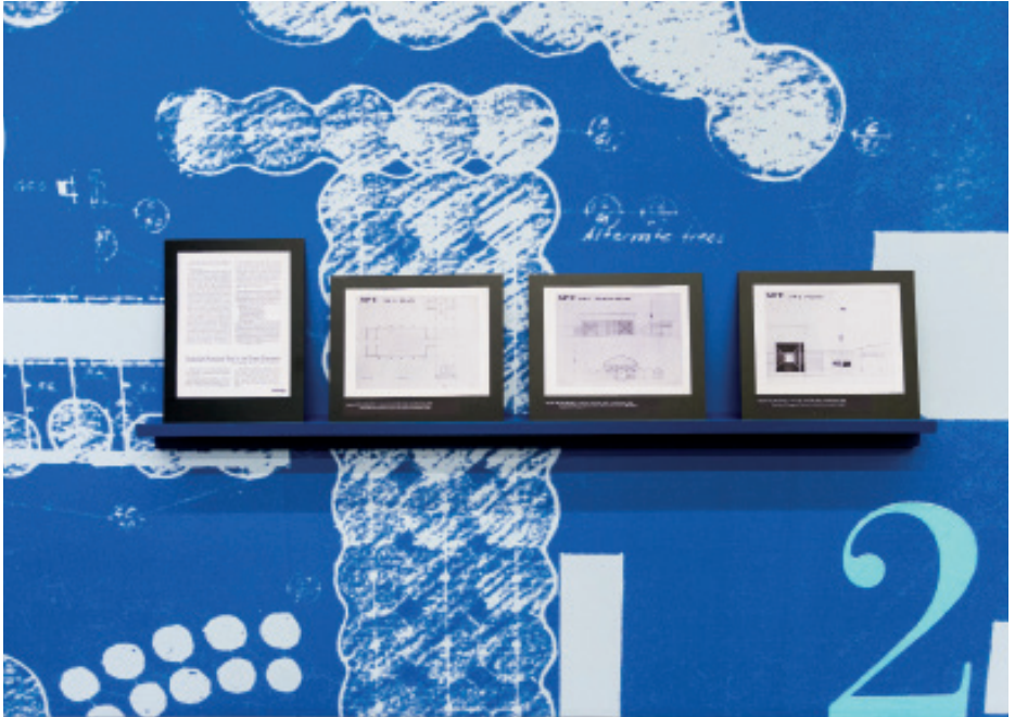
Exhibition of TASK, a magazine published from 1941 to 1945 by architecture students from the GSD, MIT, and Smith College, including the early work of architect I. M. Pei MArch '46.