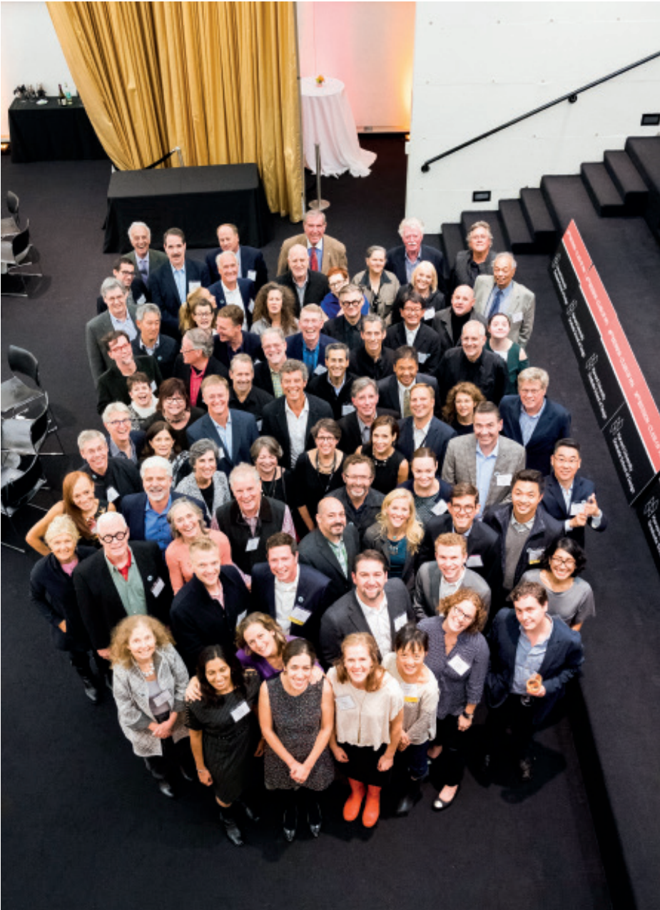
Alumni at GSD Reunion Weekend.