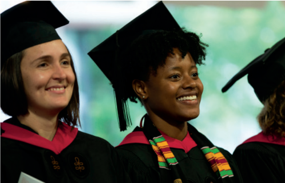
GSD students at Commencement.