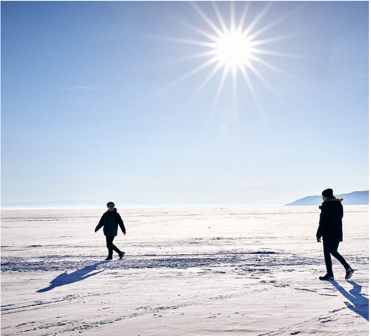
Students in the Trans-Siberian Railway Option Studio in Siberia, Spring 2019

Employ Design, Gain Experience, and Challenge Global Issues