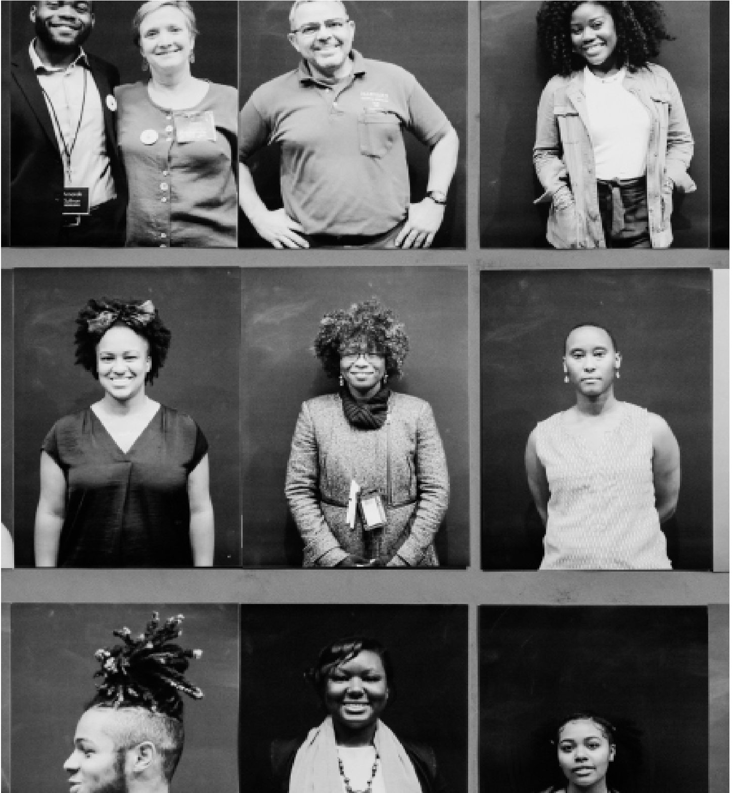
Black in Design Conference, Fall 2019

Revealing the boundless capacity and power of a network of Black designers